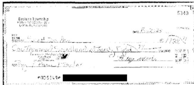
Check 5349 Amount $1,728.74 On 5/05/2023

The APA obtained the monthly statements for the Township's bank accounts from its fiscal year 2023 audit waiver request. From those statements, the APA noted that eight Township checks written during the examination period contained only one signature. An example of such checks is shown below.